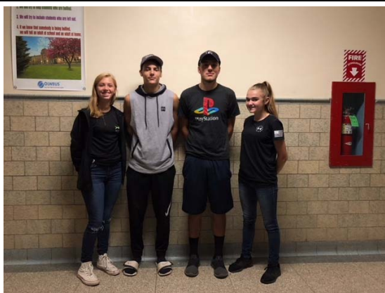
Meet our 2018-2019 Student Government Officers!